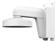
DS-1273ZJ-130B Wall Mount with junction box