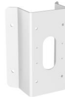
DS-1476ZJ-Y Corner Mount