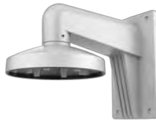
DS-1473ZJ-155-Y Wall Mount