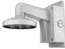
DS-1473ZJ-155B Wall Mount