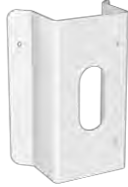
DS-1476ZJ-SUS Corner Mount