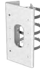
DS-1475ZJ-SUS Vertical Mount