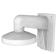
DS-1473ZJ-155 Wall Mount