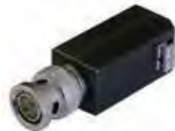
DS-1H18 Video Balun