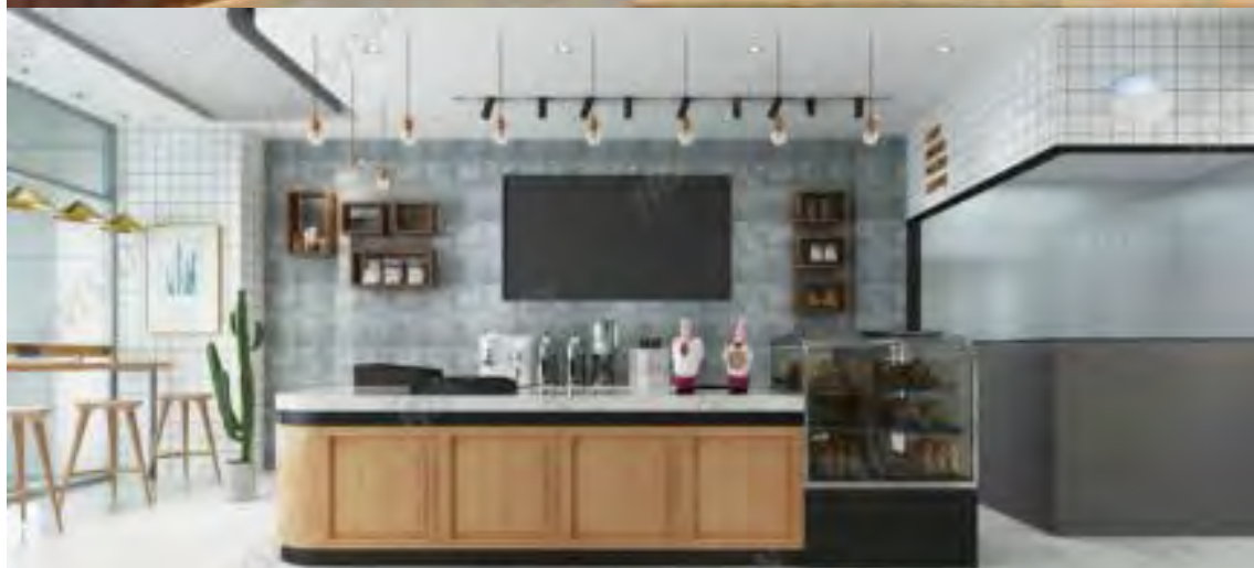
连锁门店广告展示相较于液晶显示器 无缝高亮展示 Chain store advertising display, compared to LCD display, seamless high brightness display